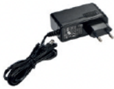
TESLA Robostar T40, power adapter