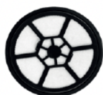
TESLA AeroStar T500, HEPA filter (input)